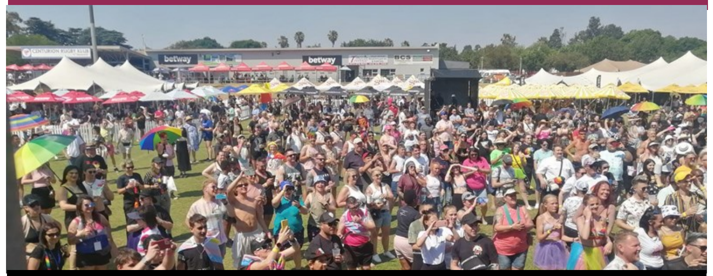
Pretoria Pride, South Africa 5th October 2024

PinkUk LGBTQ+ guide for the UK & worldwide