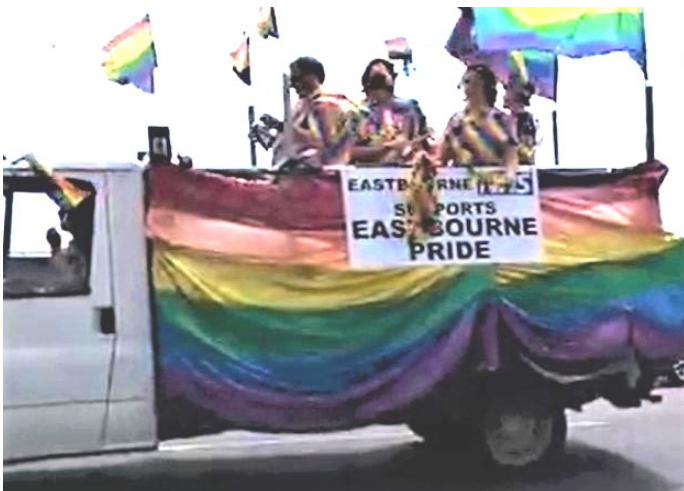
Float at Eastbourne Pride 2019 The NHS supported the event

Hi, PinkUK.com news on the UK and worldwide LGBTQ+ scene when we need it