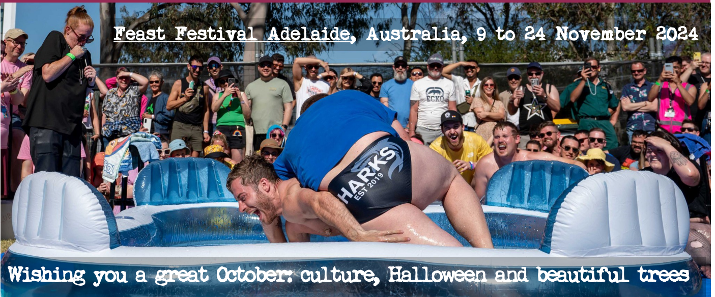
Feast Festival Adelaide, Australia, 9 to 24 November 2024

PinkUK LGBTQ+ guide for the UK & worldwide