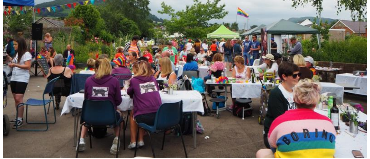
Abergavenny Pride takes place on Saturday the 24th June 2023.

Abergavenny Pride was established in 2019 and is now in its fourth year. 2023 will see its first pride parade that starts at 11am and will parade through the town. The festival will start after the parade finishes at 12, noon. Great work Abergavenny