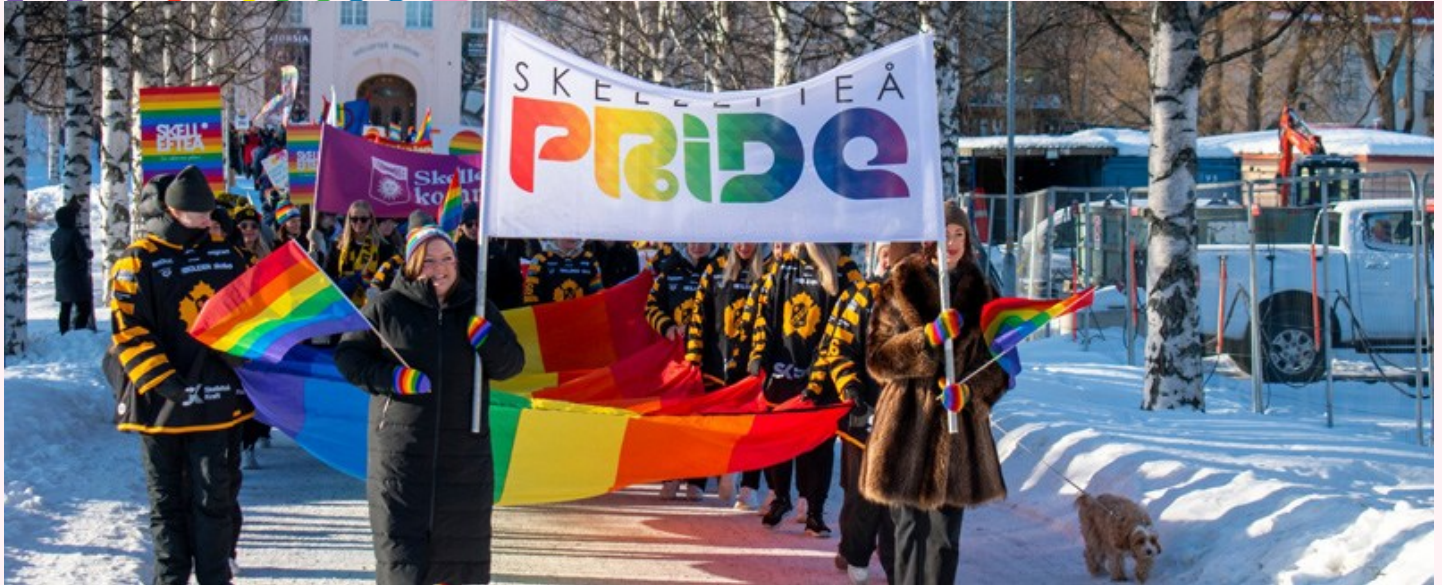
Skellefteå Pride 2026, Skellefteå, Sweden 8th to 14th February 2026

N ow that Christmas is over, we can look forward and plan what we are going to do in 2026 as we build up our list of prides . In 2025 we had a record number of prides listed on PinkUK with 1,308 in 59 countries.