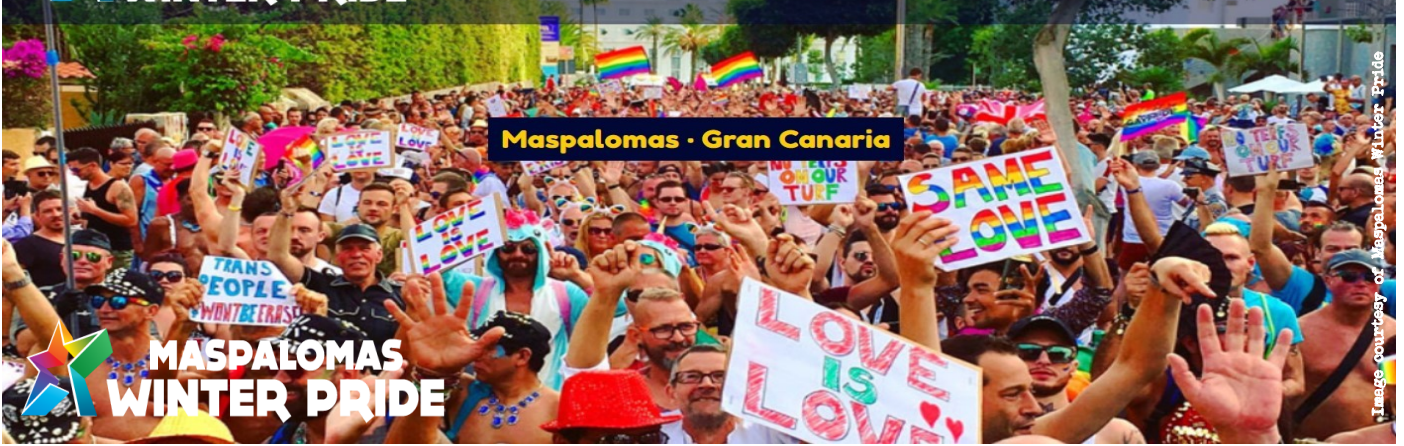
Maspalomas - Gran Canaria

PinkUk.com LGBTQ+ guide for the UK & worldwide